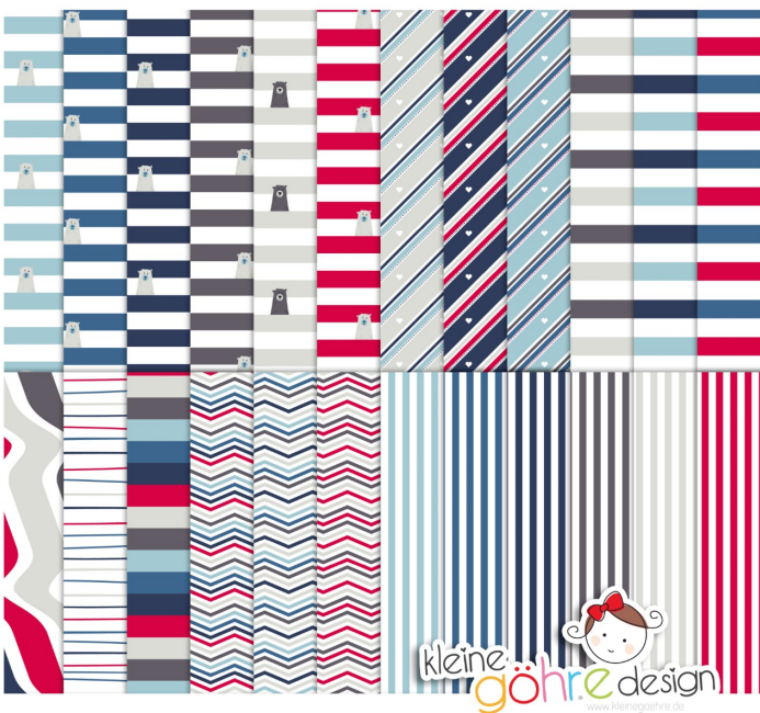
digitale Papiere "du+ich Streifen"