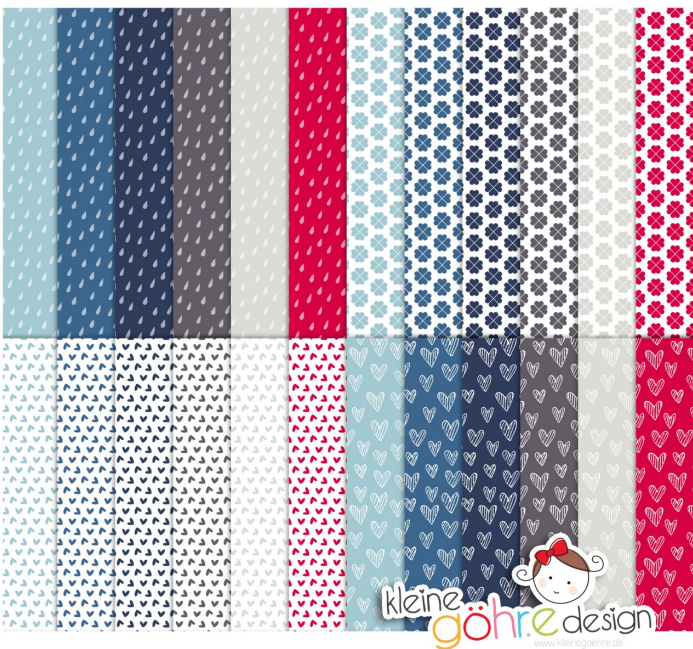
digitale Papiere "du+ich Basic"