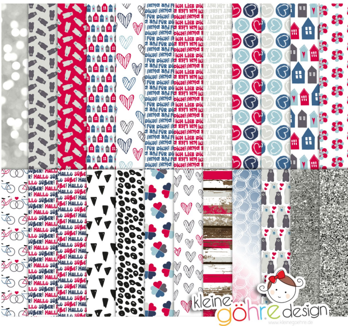
digitale Papiere "du+ich Muster 2"